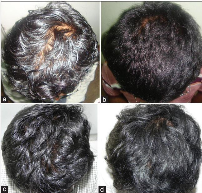
Figure 1: (a) Initial stage before starting treatment, (b) Improvement after oral finasteride treatment at eight months, (c) Initial decline in hair density when oral finasteride was stopped, (d) Plateauing of hair loss with well maintained hair density

Of the 45 patients (on continuous treatment), 25 patients' hair density was moderately maintained, as given in Table 1. These patients when shifted from oral to topical finasteride initially experienced some hair loss and then reached a plateau phase. They had no further hair loss and the hair density was well maintained [Figure 1a-d]. Seven patients had a slight decline in hair density when shifted from oral finasteride to topical treatment alone as seen in [Figure 2a-c] and 13 patients did not experience a decline and even showed an improvement in the hair density.