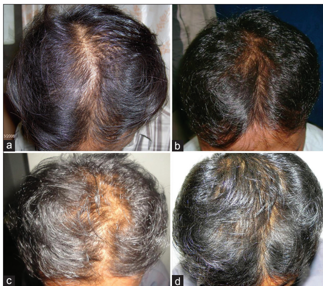
Figure 3: (a) Initial phase before starting treatment, (b) Improvement noticed after oral finasteride treatment, (c) Decline in hair density after stopping the treatment for a period of eight months, (d) Good improvement in hair density after restarting topical medication

5 \alpha reductase causes conversion of testosterone to DHT and finasteride is an inhibitor of type II 5 \alpha reductase, thereby reducing the formation of DHT molecules. [1] Hence, patients on oral finasteride have lower concentrations of DHT in blood, thereby a reduced DHT level is noticed in the scalp. This in turn reduces the follicular miniaturization and increases the anagen: telogen ratio. [3]